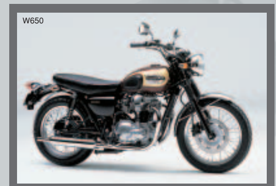
Classic Beauty in a Modern Machine

Sales of the W650, a re-release of the popular W1, commence.